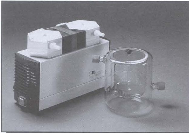
PU850 Trap shown with KNF N820.3FTP Vacuum Pump